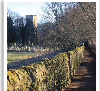
The lane leading to Church of St. Mary & St. Stephen.